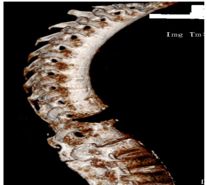
Figure 2. MRI 3D reconstruction of the comminuted fracture of the Th12 vertebra