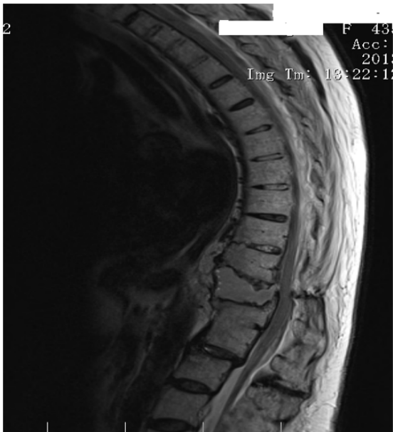
Figure 1. MRI image of the comminuted fracture of the Th12 vertebra