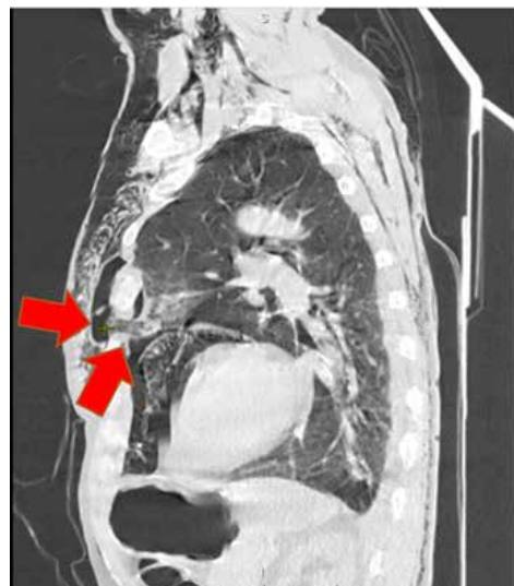
Figure 3. Sagittal view of chest computed tomography image that shows the left lung that herniates through a chest wall defect (red arrows).