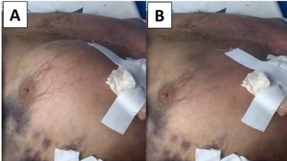
Figure 1. (A) and (B) Paradoxical movement as seen at the time of patient admission.